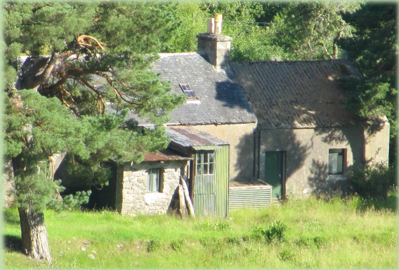
House at Cranachan – home of 5 ‘wonderful, eccentric Highlanders’