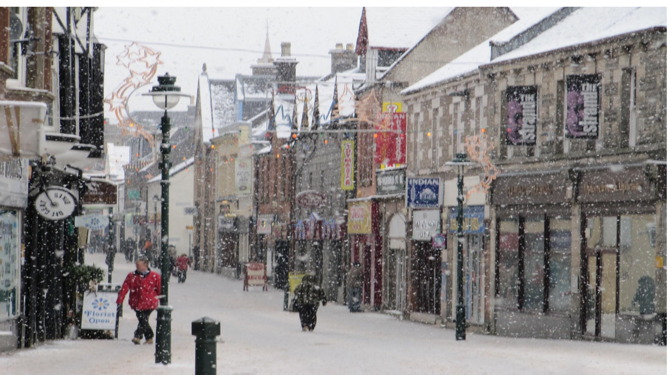
THE HIGH STREET FORT WILLIAM