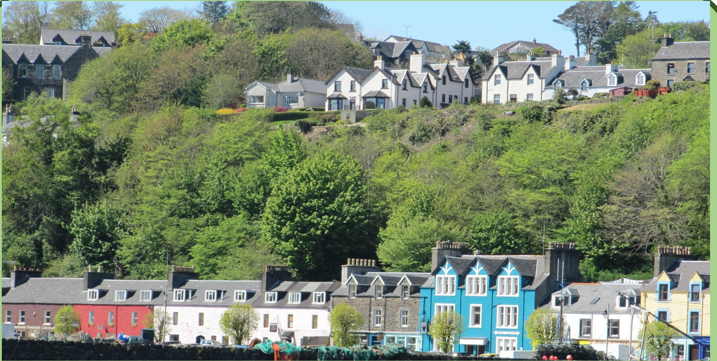
Tobermory – Isle of Mull