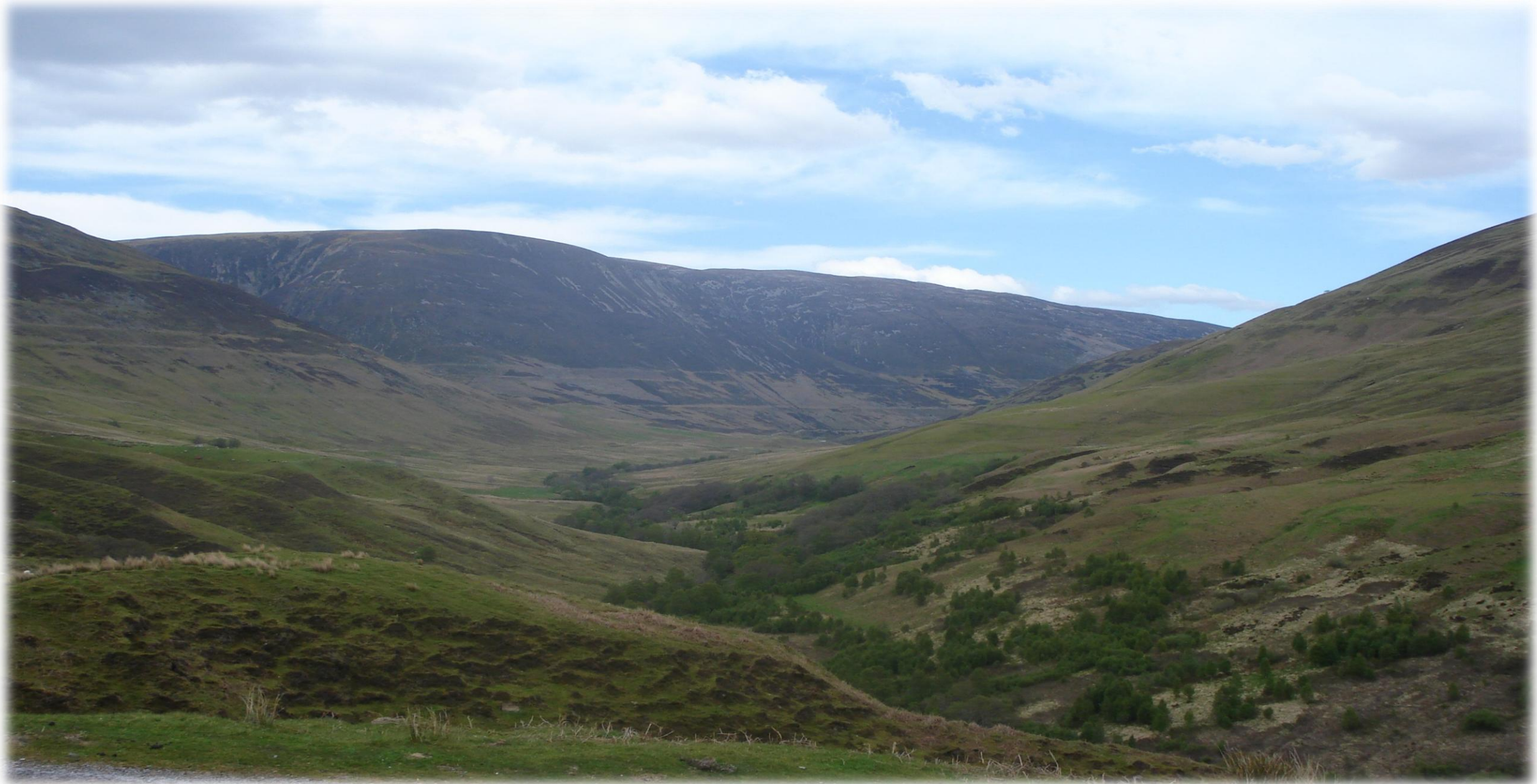
Glen Roy – Ancestral Lands of the Keppock MacDonald Clan