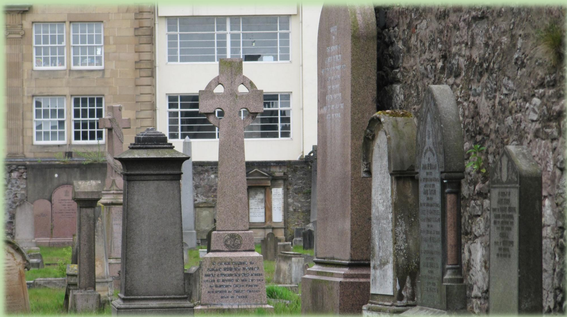
Greenside Cemetery, Alloa, where Uncle Archie MacKillop is buried