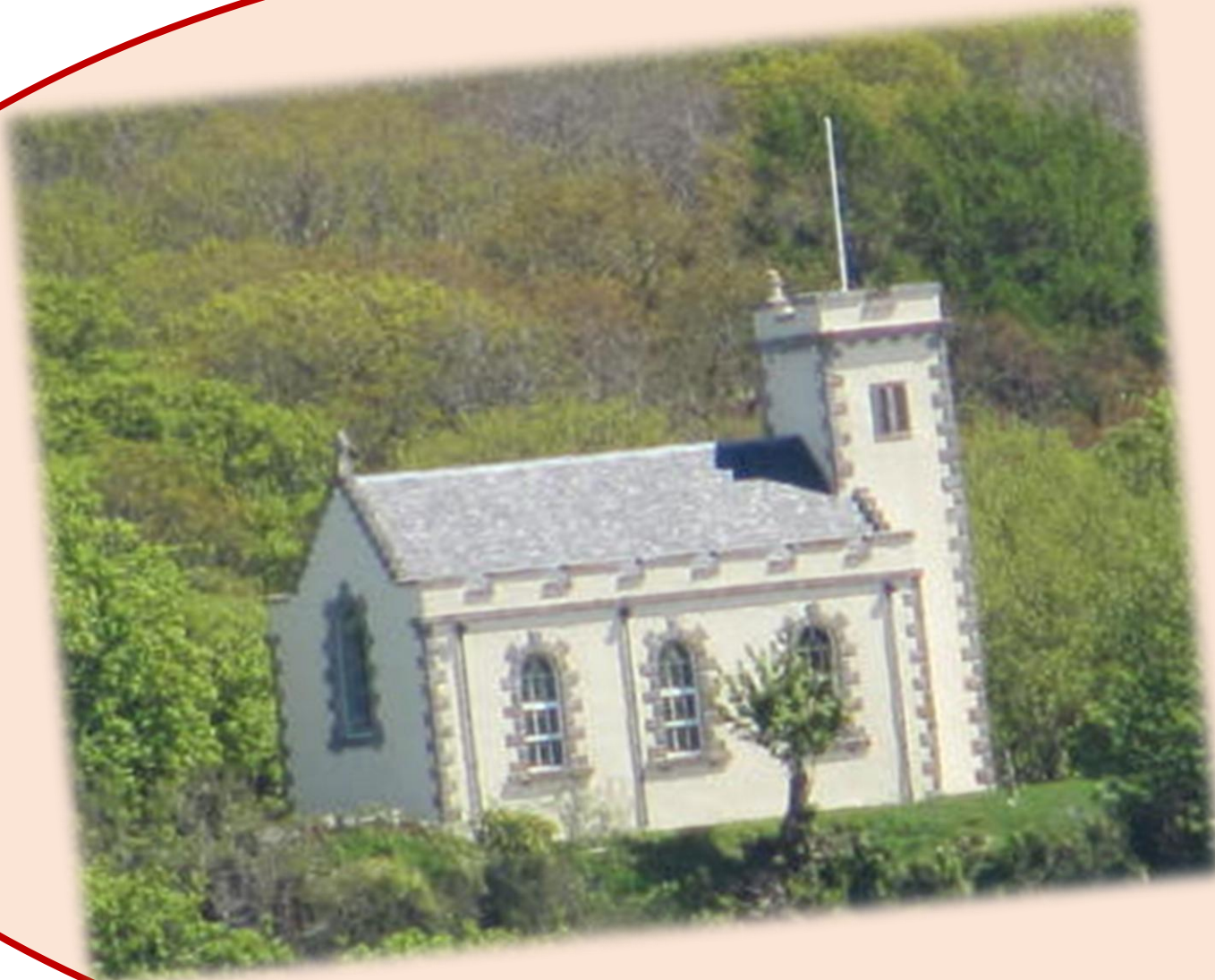
Chapel At Drimnin House