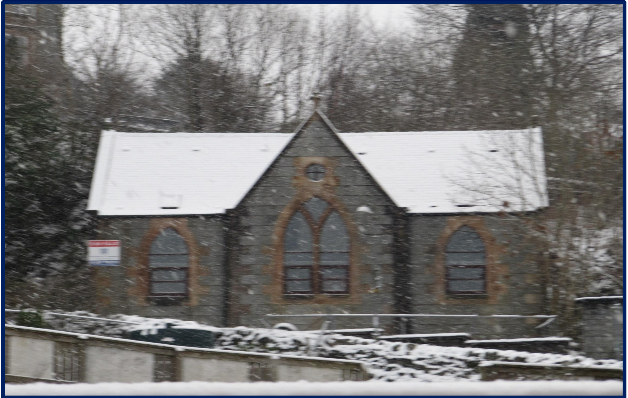
ORIGINAL PARISH CHURCH FORT WILLIAM