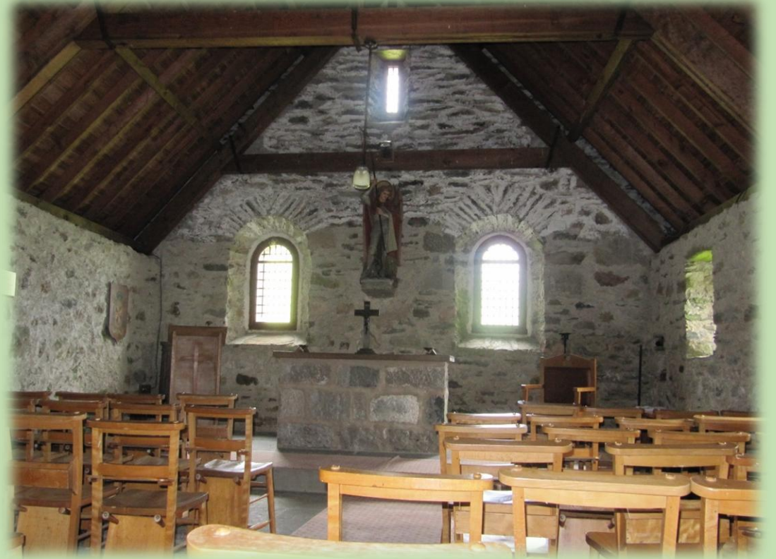
Cille Choirill – Historic 15 th Century Catholic Cemetery