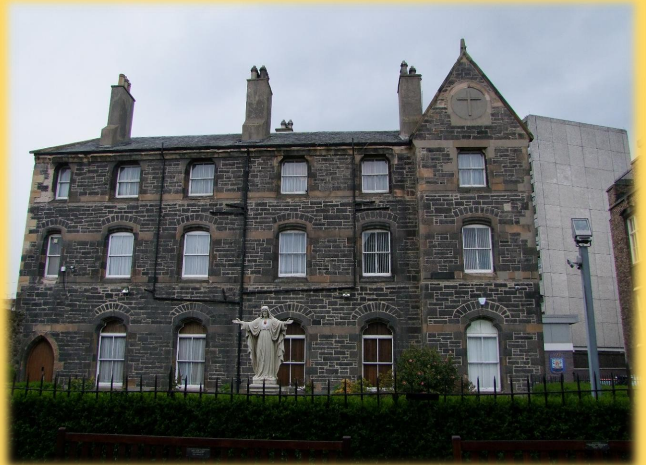
Our Lady Star of the Sea – Oblate Fathers