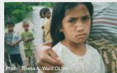
Girl injured in machete attack

Australian governments consistently upheld the Indonesian annexation of East Timor in the United Nations.