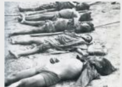
Casualties of "Fence of Legs" operation 1981 (smuggled photo) from Michele Turner's book "Telling"

Routine torture, killings, rape, and politically induced starvation account for 183,000 people