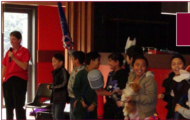
A visit to St Peter's School, Clayton today. Thank you for your fundraising for the Mary MacKillop Foundation.